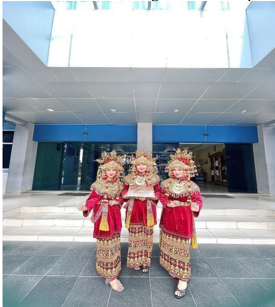
(24 juni 2023, Tari sambut telumuli cindo)

In South Sumatra, there are many sambut dances where each region has its own sambut dance identity which has meaning and contains cultural elements in a region, many provinces perform sambut dances for formal and non-formal events because it is a characteristic in each region to welcome invited guests with respect and a happy heart.