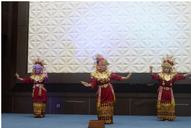
(24 juni 2023, Tari sambut telu muli cindo)

The telu muli cindo welcome dance is a development of the serasan seandanan welcome dance. A welcome dance originating from South Ogan Komering Ulu. Telu muli cindo comes from one of the Komering languages which means "Telu" (three) "Muli" (Girl/woman) "cindo" (Beautiful) In this dance, this dance is danced by three female dancers where one of the dancers carries a tepak containing betel as a sign of honor to important guests who come to a big event that is being held. The agile movements of the dancers who move to the right and left accompanied by traditional music typical of South Ogan Komering Ulu make this dance so beautiful. The dancer's movements seem to give a welcome signal to the guests. And once the dancer throws a smile to the invited guests symbolizes happiness.